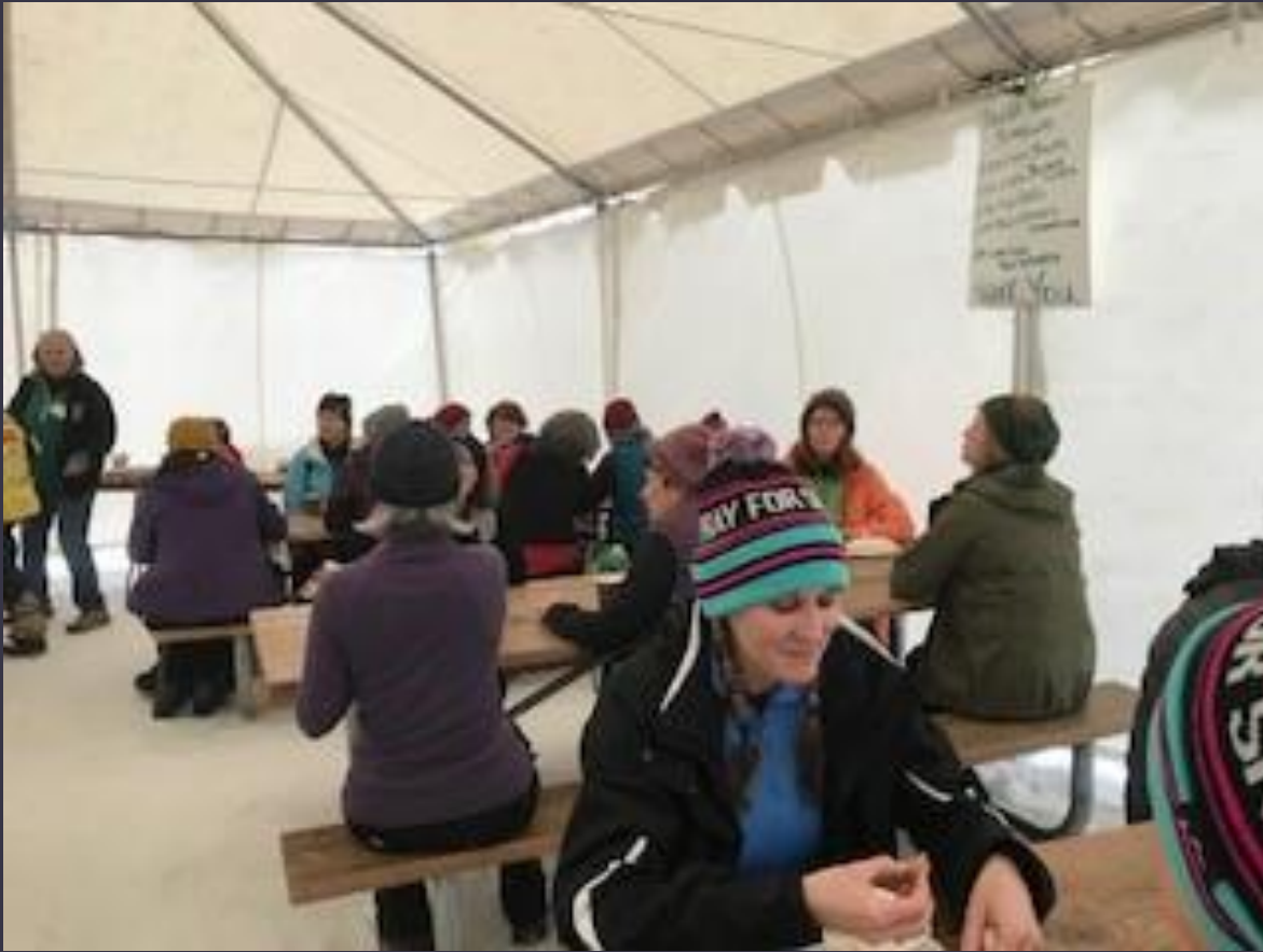
2018 Souper Bowl Participants