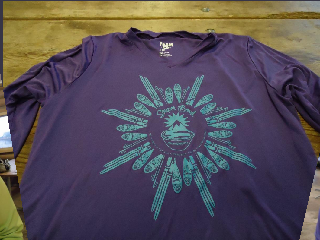
2018 Souper Bowl Shirt