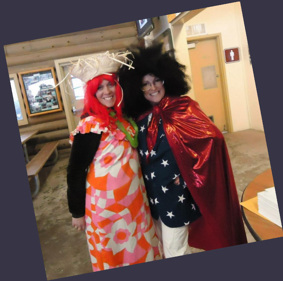
2018 Souper Bowl Participants